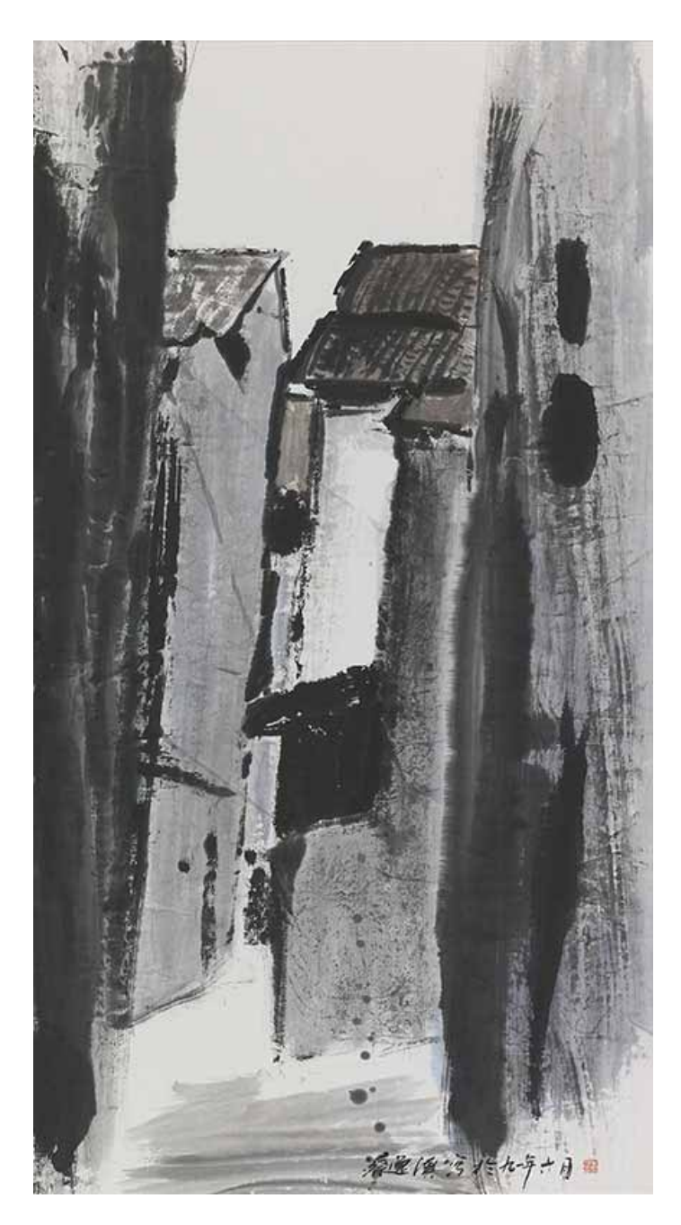
Fig. 3b My Haunt by Chua Ek Kay, 1991 Chinese Ink and Colour on Paper 199.5 x 113.7 cm