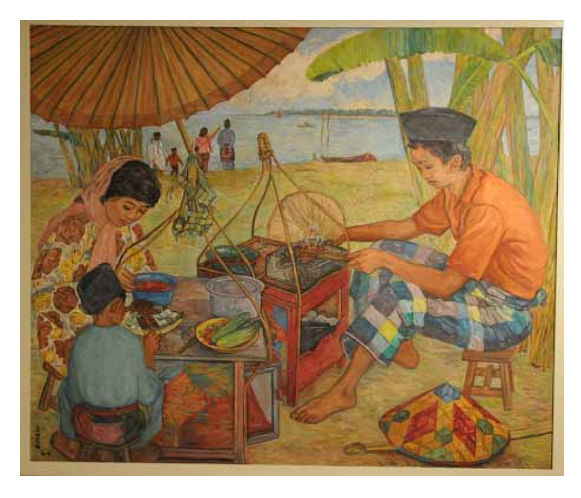
Fig. 3a Satay Boy by Georgette Chen, 1964 Oil on Canvas, 161 x 135 cm