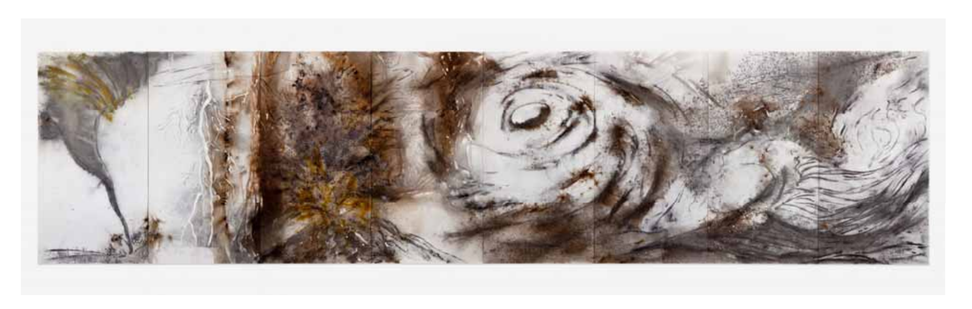
Fig. 4a Chaos in Nature by Cai Guo Qiang, 2012 Gunpowder on canvas, mounted on wood as eight-panel screen 340.4 x 1066.8cm