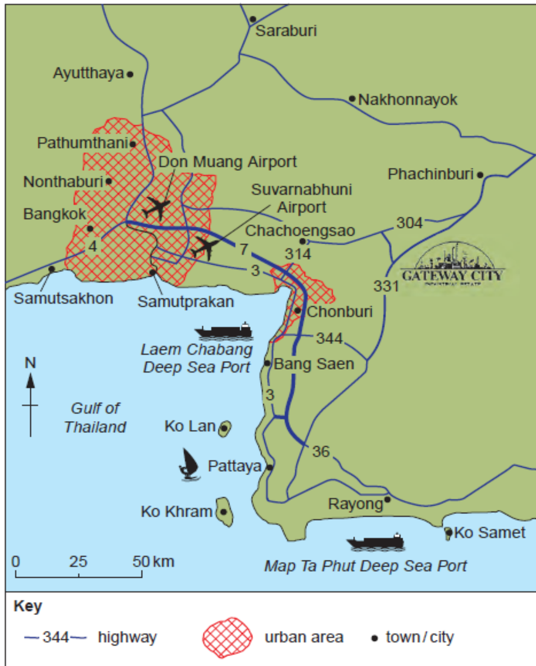
Fig. 3 for Question 4 Location of Gateway City in Thailand