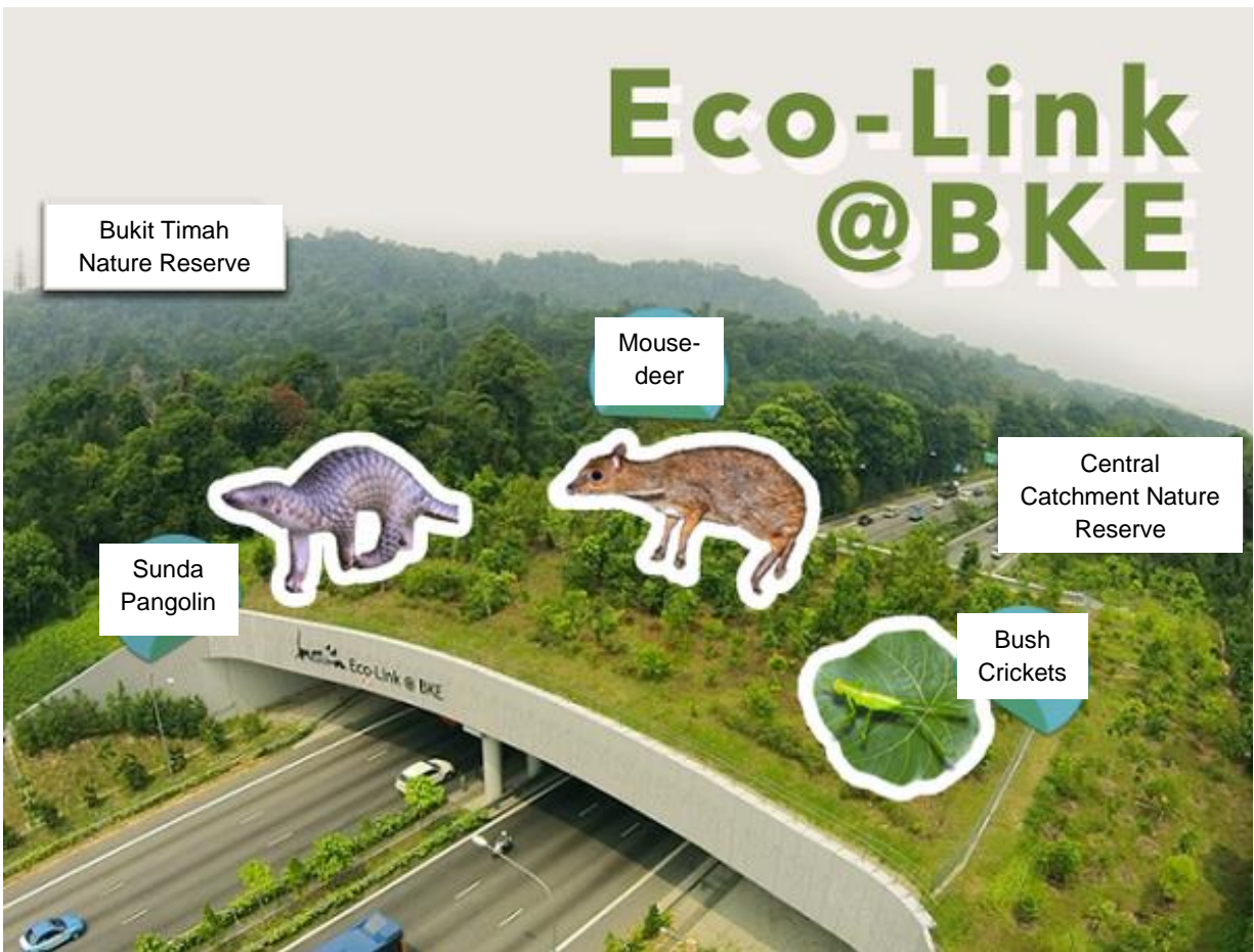
Fig. 1.1 for Question 1