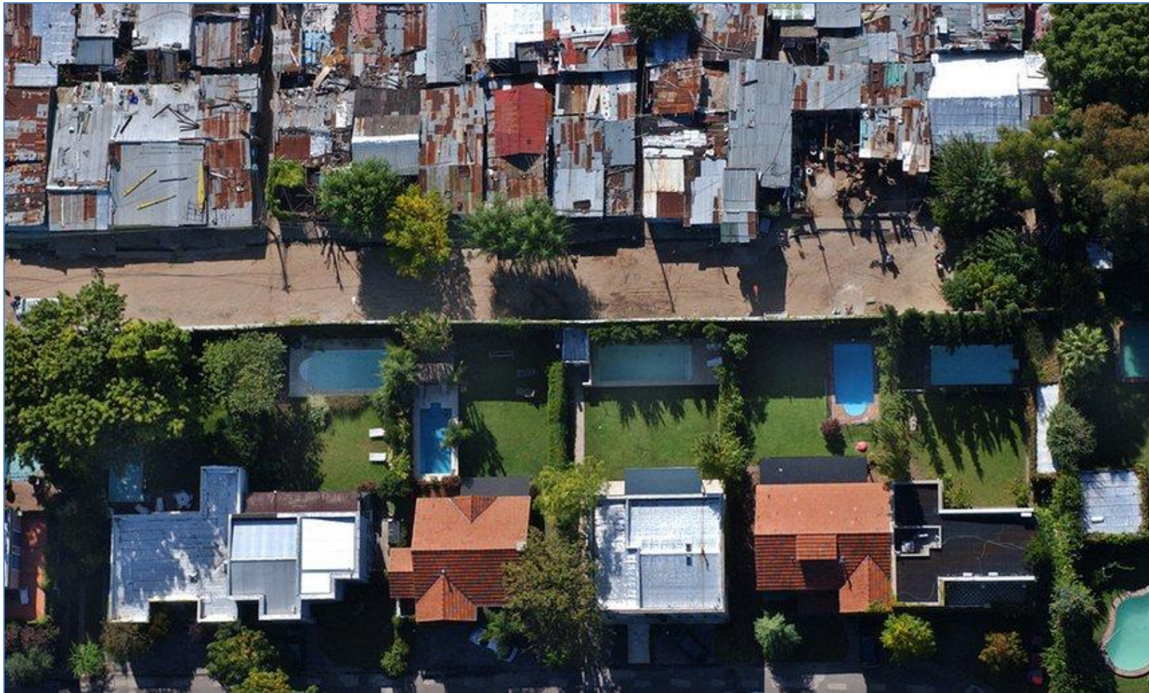
Photograph A for Question 3 Slum neighbourhood of La Cava and gated suburban community in Buenos Aire, Argentina (2003)