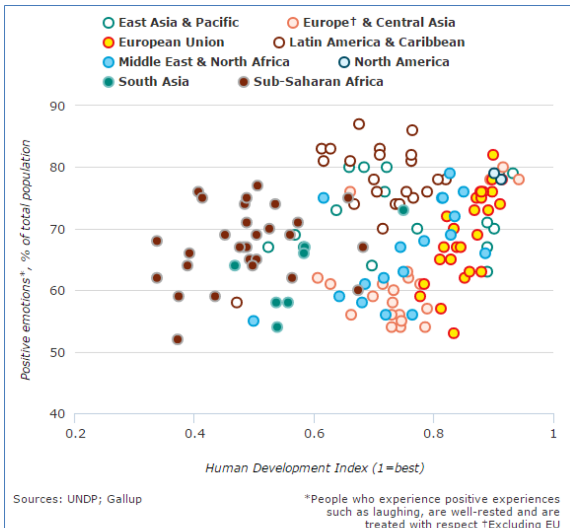
Fig. 1 for Question 1 Self-Reported Happiness and Human Development Index (as of 2013)