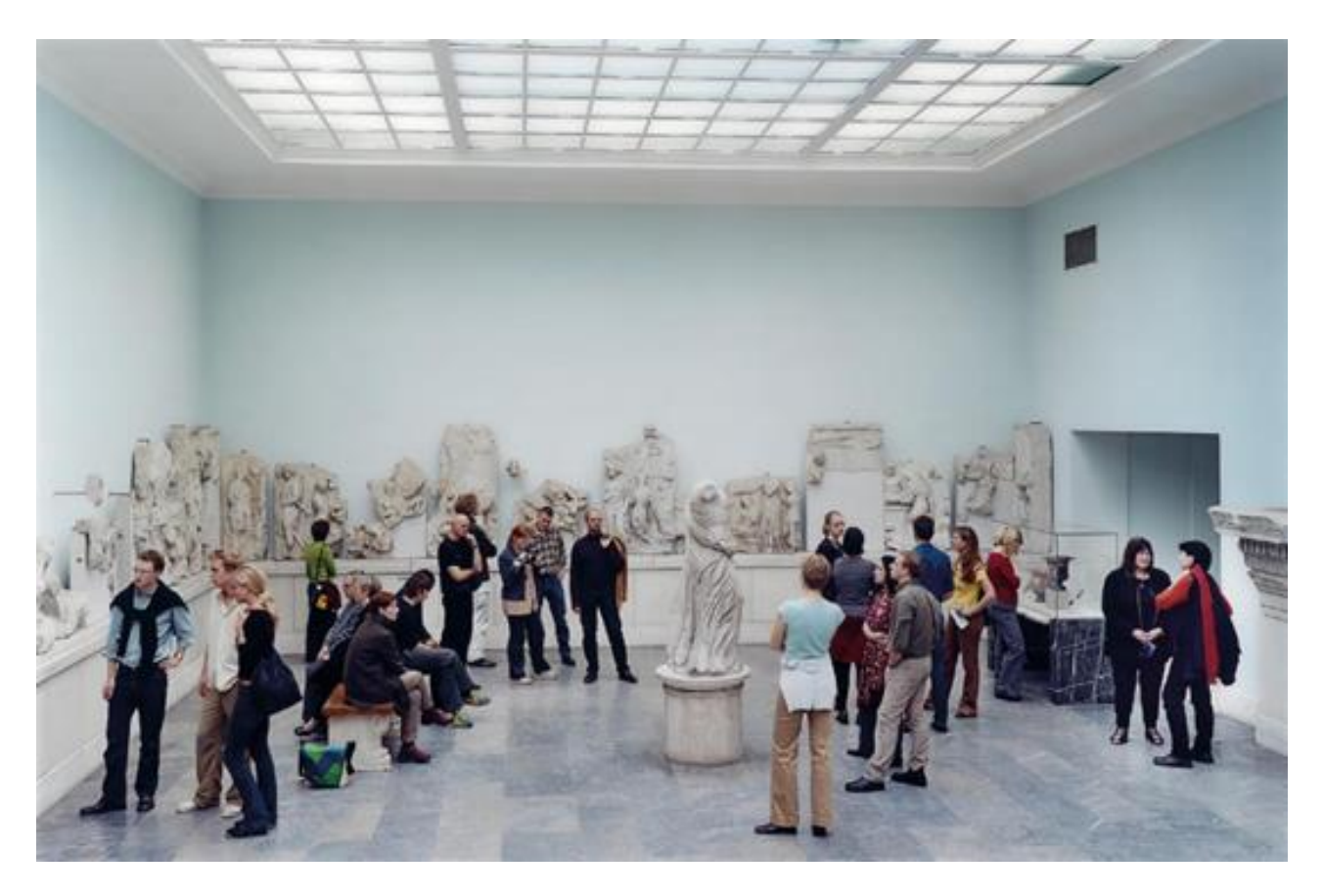
Section A Figure 2:

Pergamon Museum IV, Berlin by Thomas Struth, 2001 C-print photograph, edition 1/10, 144.1 x 219.9 cm