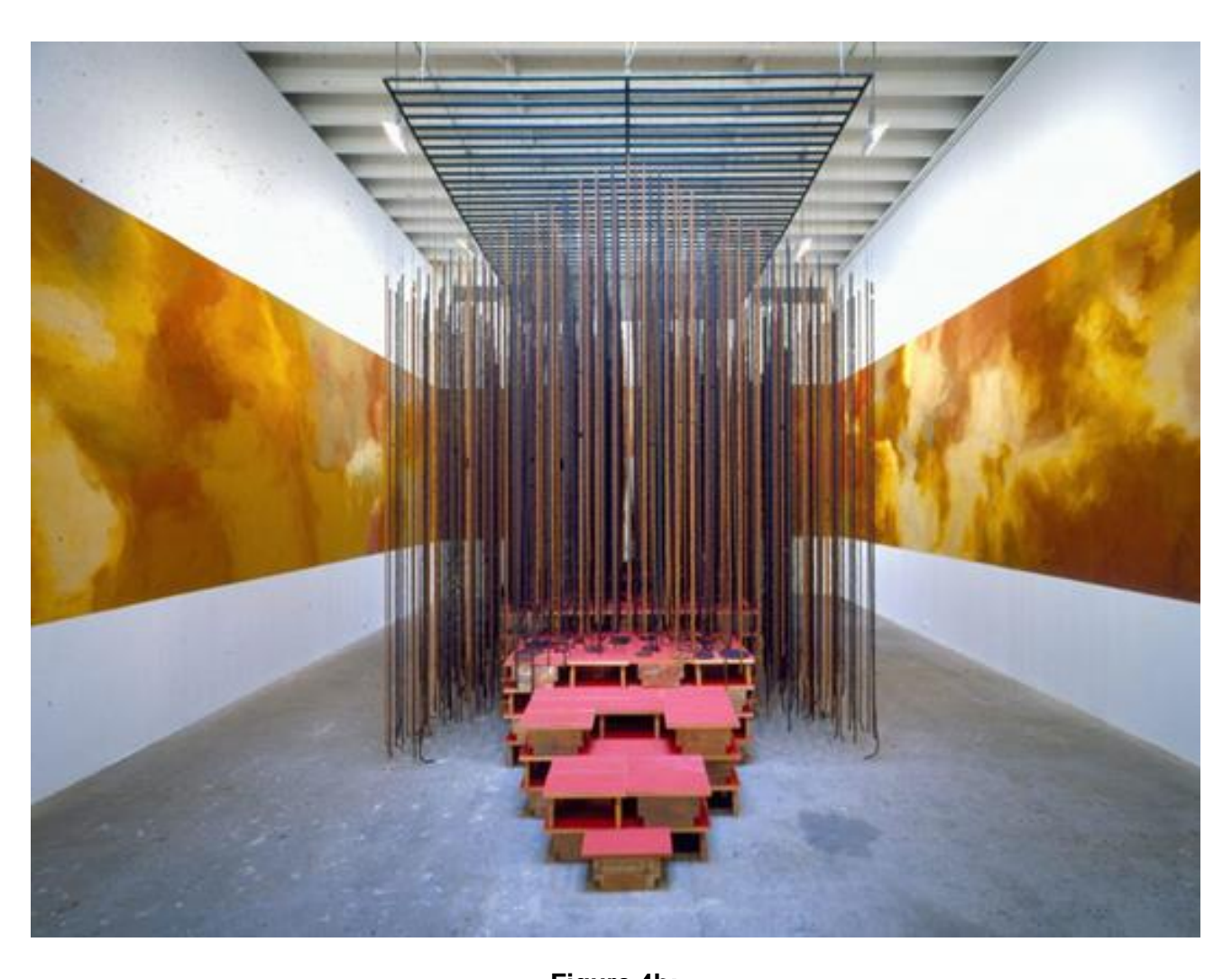
Figure 4b: House of Hope by Montien Boonma. 1996-97 Steel grill, herbs, herbal medicine, and mixed media. 400 x 300 x 600 cm. Collection of Estate of Montien Boonma, Bangkok.