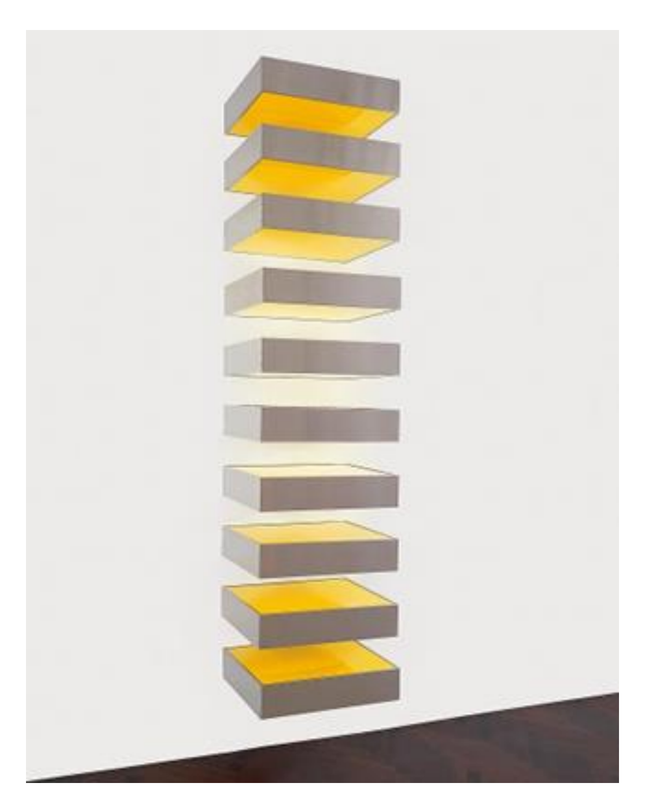
Figure 3b: Untitled (Bernstein 80-52), by Donald Judd 1980 Stainless steel and yellow plexiglas, 10 units, each 15.2 x 68.6 x 61 cm Judd Foundation, New York