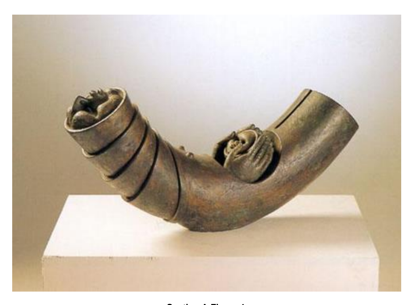
Section A Figure 1: Mother and Child by Ng Eng Teng 1974 Ciment-fondu 40 x 85 x 20cm Collection of National Heritage Board/ Singapore Art Museum