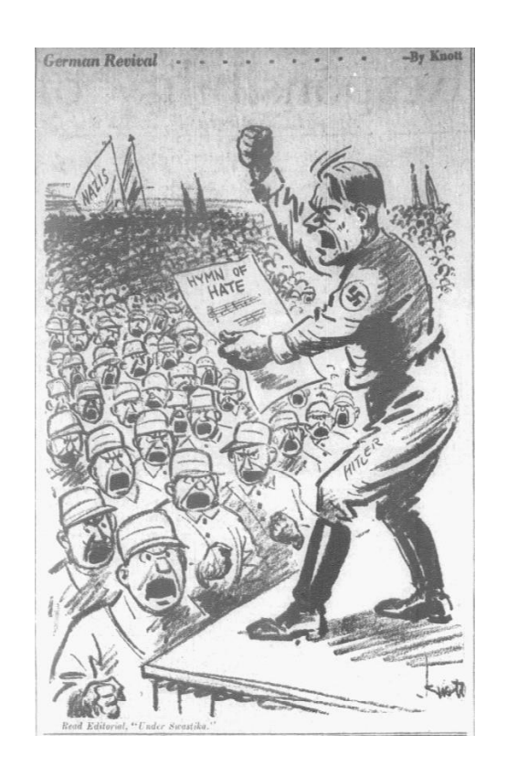
Source B: An American cartoon published in 1933. The paper says "Hymn of Hate". A Hymn is a religious song sung during church services.