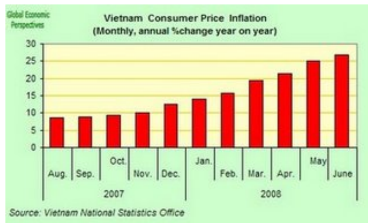
Figure 4: Vietnam Consumer Price Inflation

The government has made fighting inflation its top priority. The central bank raised interest rates by 3 percentage points to restrain borrowing and encourage saving. In the past few months, the government has also postponed public investment projects and ordered state agencies to cut spending by at least 10 percent. As such, the authorities foresee slower growth ahead. Earlier this month, Vietnam slashed its annual growth target to 7 percent from 8.5 percent.