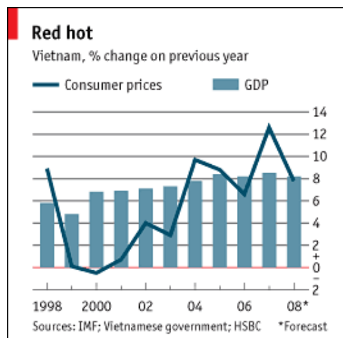
Figure 3: Vietnam's GDP Growth and Inflation Rates