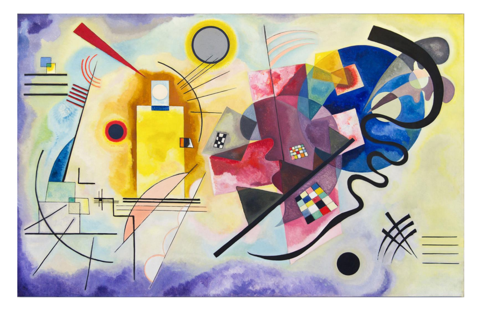
Fig. 1 Yellow-Red-Blue by Wassily Kandinsky, 1925 Oil on canvas, 128 x 201.5 cm Musée National d'Art Moderne, Centre Pompidou, Paris