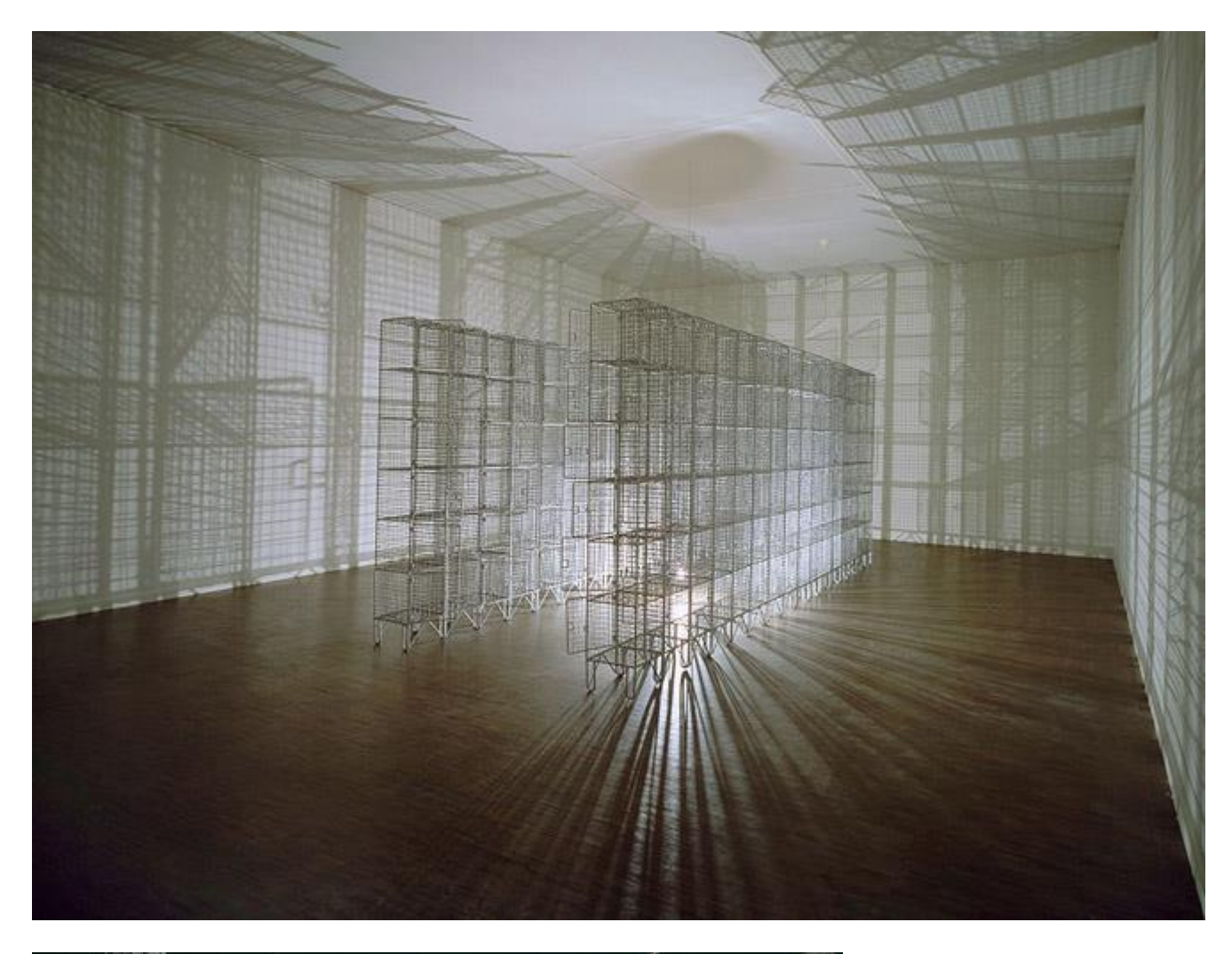
Fig. 1a & 1b Light Sentence by Mona Hatoum, 1992 36 wire mesh compartments, electric motor, light bulb 78 × 72 <sup>4/5</sup> × 192 <sup>9/10</sup> in 198 × 185 × 490 cm Centre Pompidou, Musée national d'art moderne, Paris