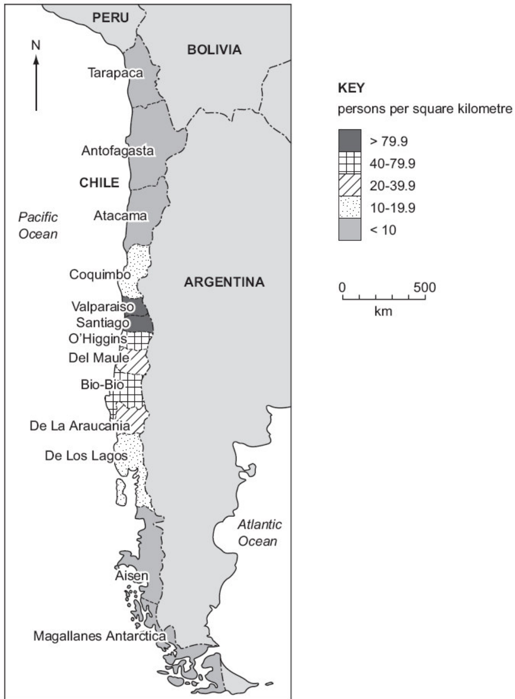
Figure 1 for Question 1 Density of population by region, Chile, 2002