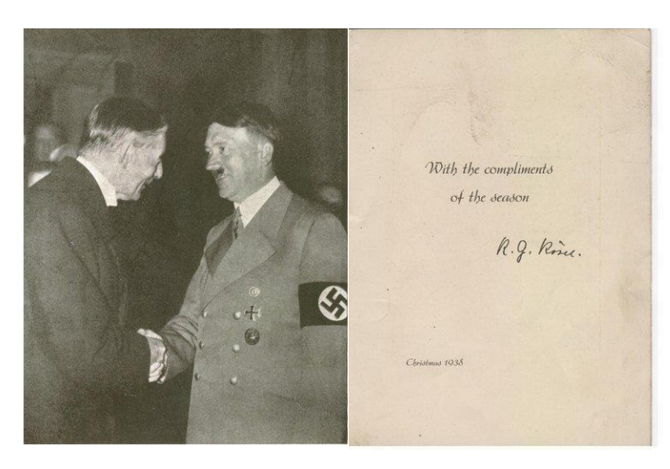
Source B A Christmas card sent out by members of the Conservative Party, in December 1938. It features Adolf Hitler and Neville Chamberlain - Leader of the Conservative Party - on the front.