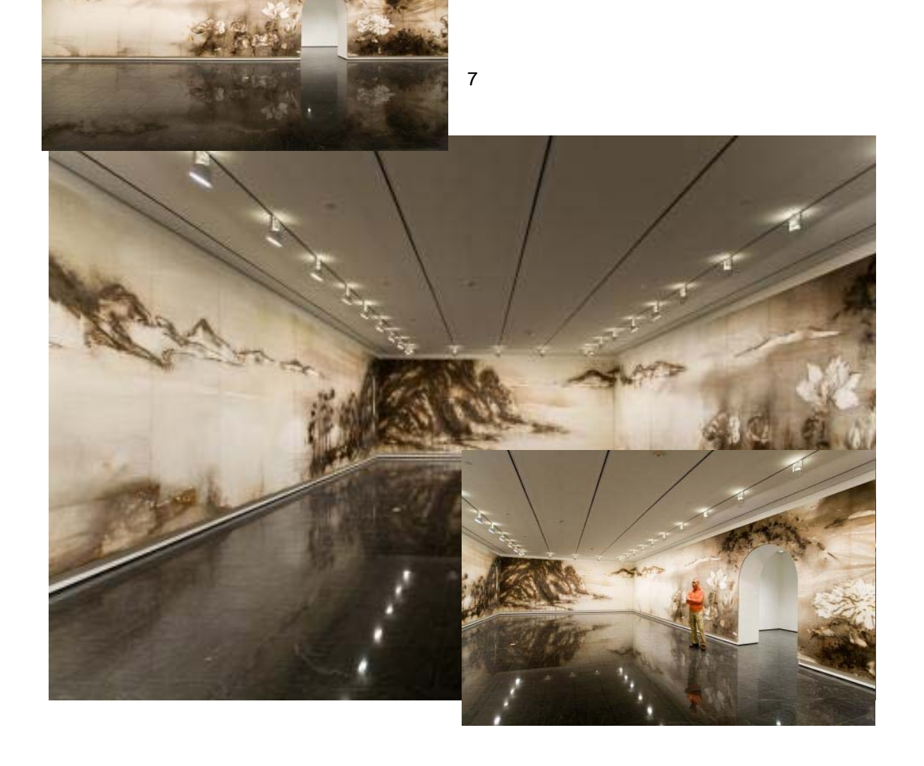
Fig. 3b Odyssey by Cai Guo Qiang, 2010 Drawing Installation with Gunpowder on paper Mounted on wood as 42-panel screen (four walls), 304.8 × 4937.8 cm Commissioned by the Museum of Fine Arts, Houston for the Ting Tsung and Wei Fong Chao Arts of China Gallery.