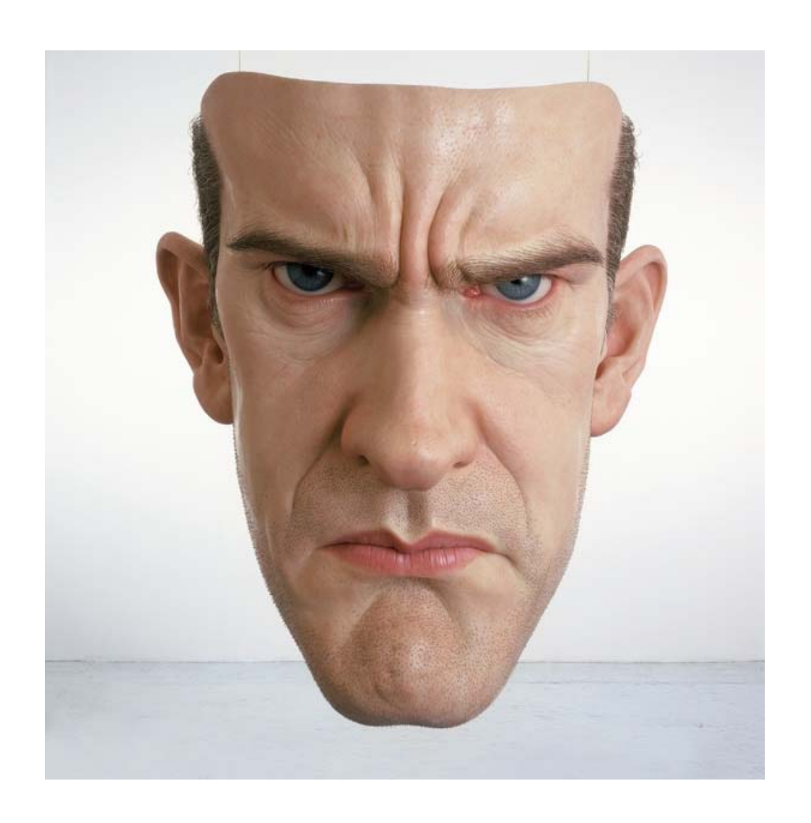
Fig. 4b Mask by Ron Mueck, 1997 Silica and mixed media relief sculpture, 158 x 153 x 124 cm Saatchi Gallery, London