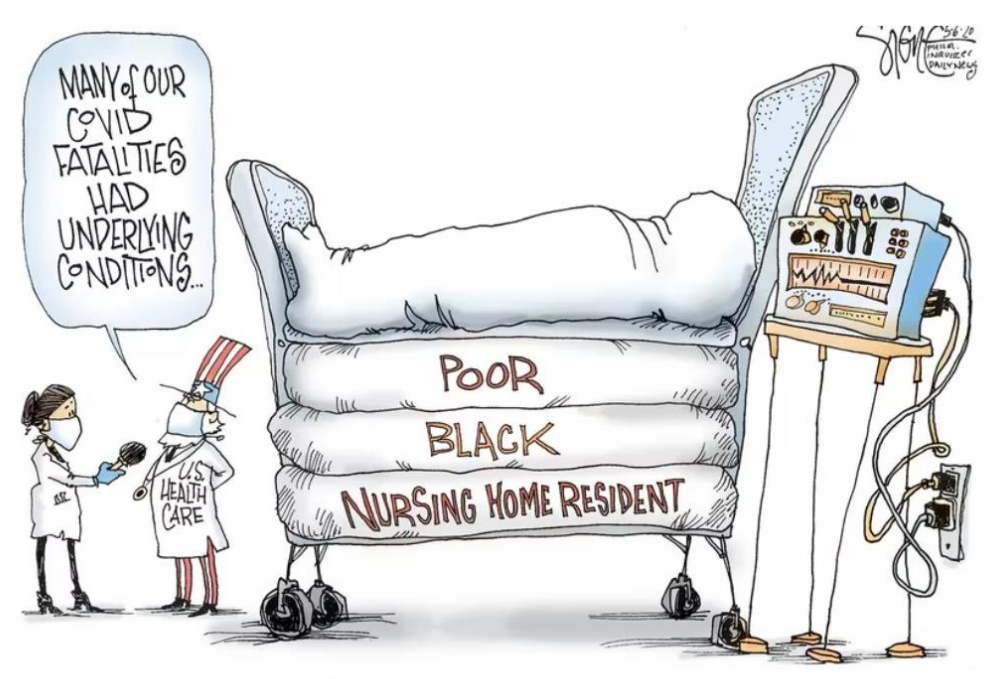
Source A: An American cartoonist's view on the American healthcare system in responding to the COVID-19 pandemic, published on an American online news site, 6 May 2020.

Study the following sources to find out in what ways the COVID-19 pandemic has impacted vulnerable groups.