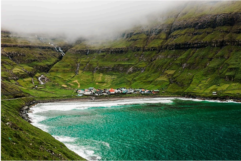
Fig. 2.1 for Question 2

Unwind and relax at one of the stunning and secluded beaches on the Faroe Islands, surrounded by dramatic cliffs and rugged landscapes.