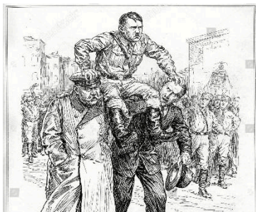
The Temporary Triangle Von Hindenburg and Von Papen (together) – –“Let’s Control him!”

Source A: A British cartoon published on 8 February 1933, titled: “The Temporary Triangle”. It shows Hitler being carried by Hindenburg (left) and Von Papen (right).