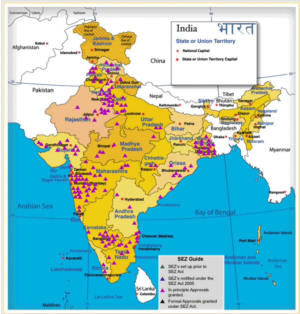
Fig. 1A Distribution of SEZs in India