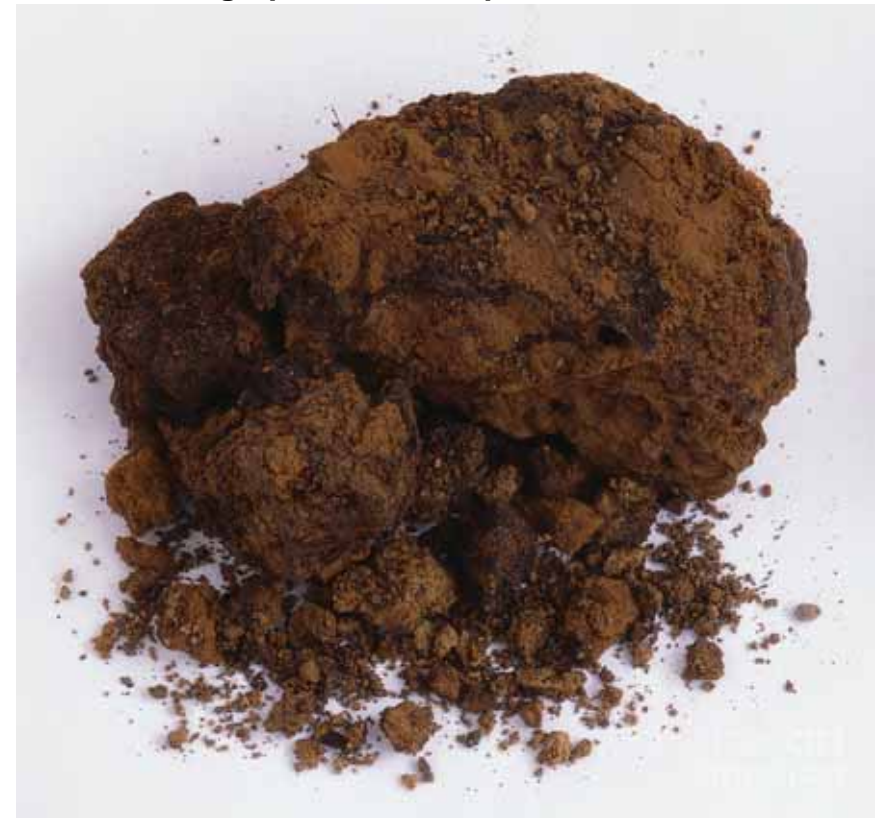
Photograph of soil sample at Site B