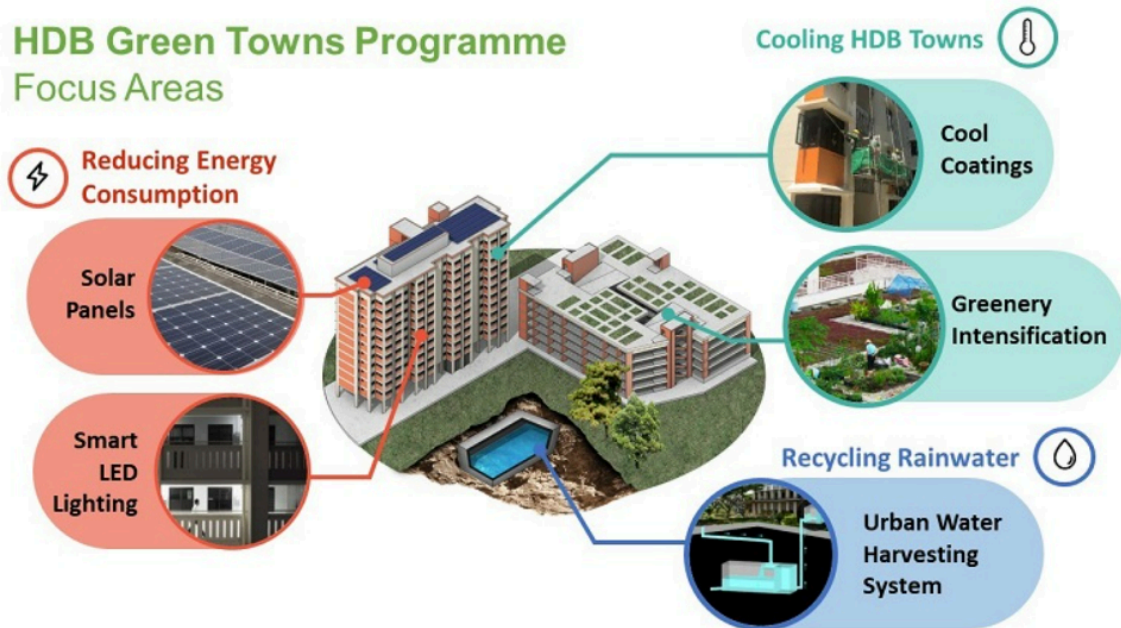
Fig. 1.4 for Question 1