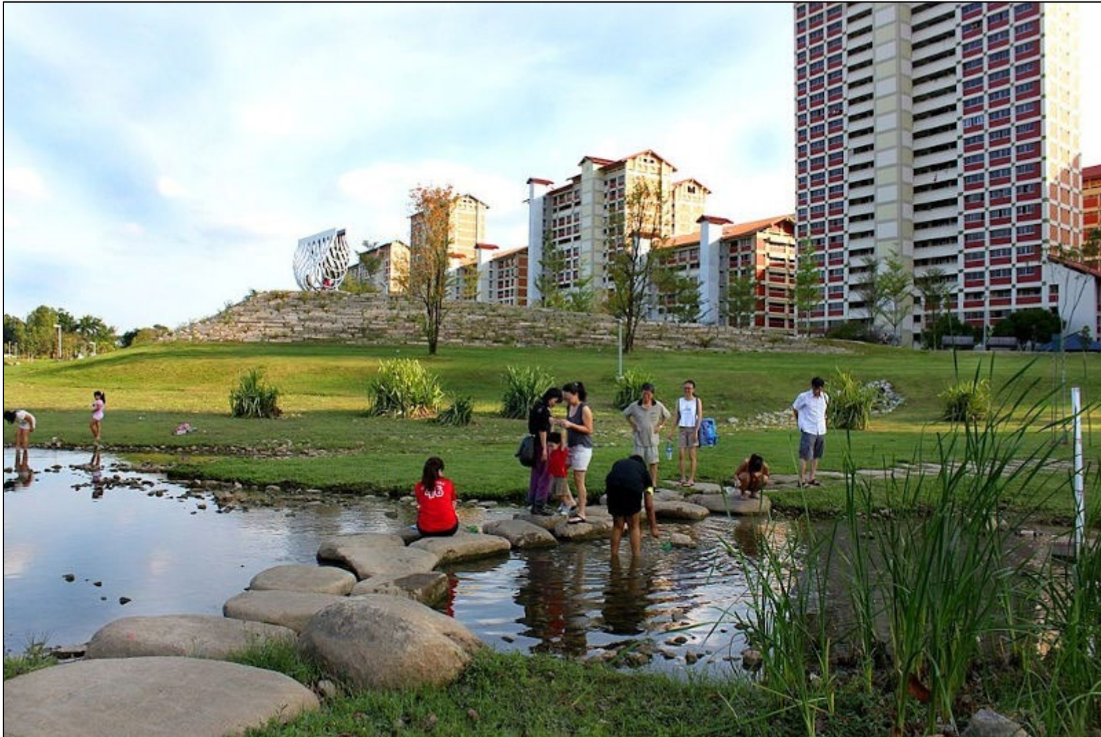
Bishan Park, Singapore